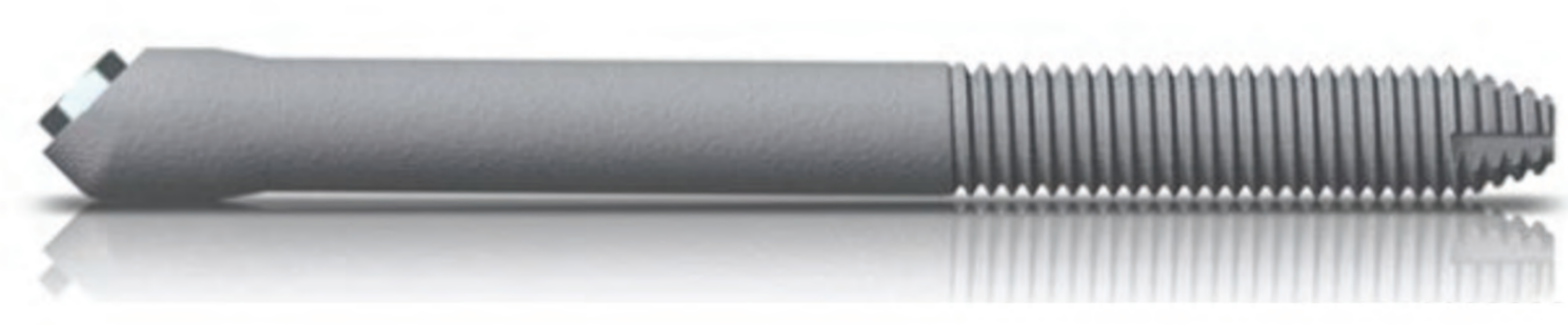
Figure 1: Study implant NobelZygoma 45°

Zygomatic implants have been validated as a satisfactory method for the rehabilitation of atrophic maxilla using a conventional two-stage approach and immediate function protocols. 1-5 Furthermore, these implants can be successfully placed at both intra-sinus and extra-sinus positions. However, most previously published studies were performed using the Brånemark System implants. The objective of this study was to retrospectively assess the clinical outcome of newly designed zygomatic implants with a tapered tip – for ease of use at insertion – and a partially unthreaded body that interfaces with the soft tissue and is not necessarily engaged in bone (Figure 1).